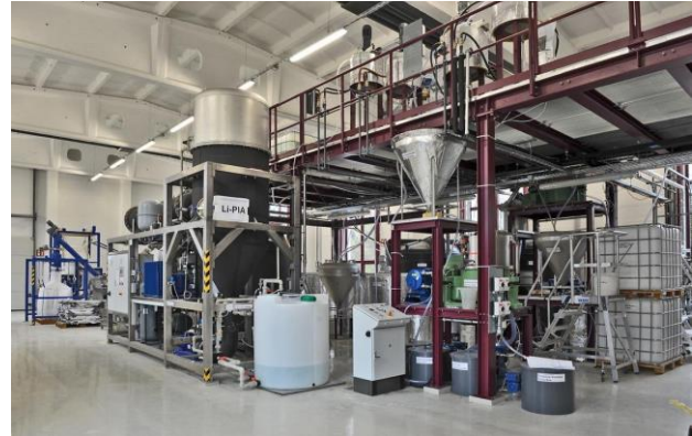
Fig. 1: K-UTEC's technical centre, with more than 1,500 sqm for process technology equipment and systems that can be flexibly combined to replicate complete production processes. The industrial scale demonstration plant allows to process several tons of raw materials into desired end products.