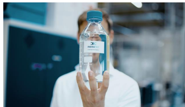
e-Fuels by INERATEC.

Published by: Deutsche Gesellschaft für Internationale Zusammenarbeit (GIZ) GmbH