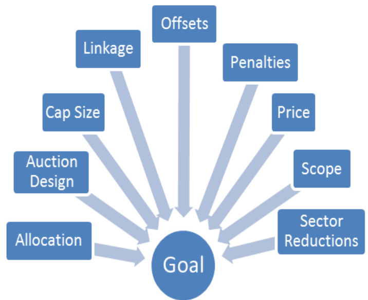
CarbonSim allows policymakers to experiment with different ETS designs to achieve a defined goal

Prior to launching an ETS , policymakers must decide the goals of the ETS and the best means to achieve them. Goals include requisite emission reductions and the date by which they must be realized. Design decisions include cap size, number of companies, required reductions, allowance distribution, registry administration, market oversight, and penalties and enforcement. Market related decisions touch on auctions, reserve, price floors/ceilings, offset restrictions, and spot/forward trading restrictions, auction frequency and design, exchange use, as well as intervals and means of government intervention against market failure.