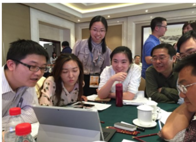
The ability to run “what-if” scenarios and get immediate feedback helps policymakers make better choices

Policymakers can use CarbonSim to see how the choices that they make – about both program design and administration – could affect the performance of the ETS. Industry carbon managers have an opportunity to deploy a variety of strategies – involving production changes, the use of abatements, and trading – to satisfy ETS obligations.